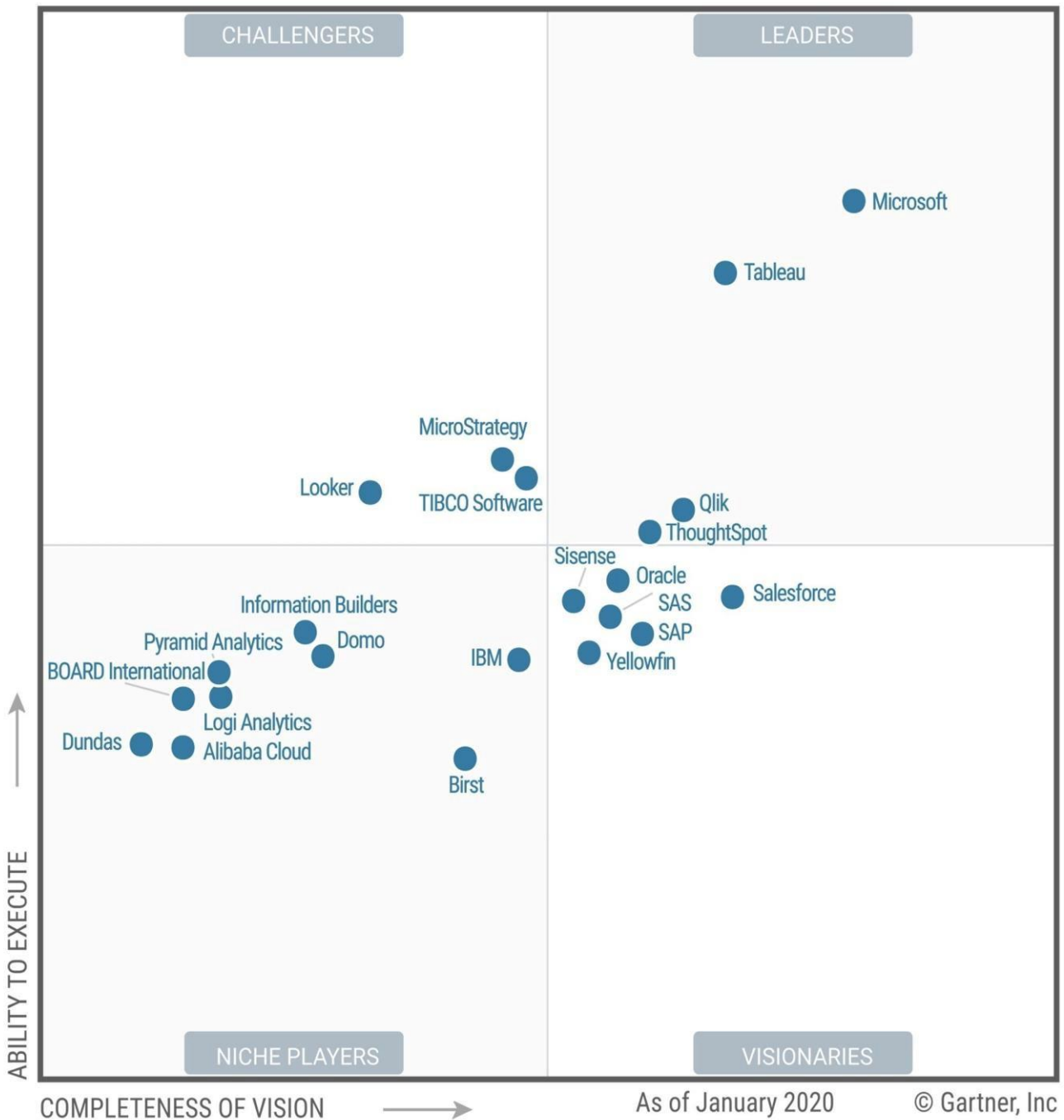
Figure 1. Magic Quadrant for Analytics and Business Intelligence Platforms